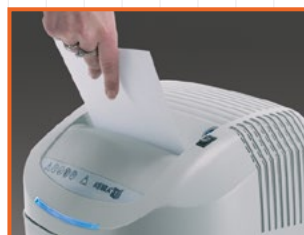
SHRED UP TO 14 SHEETS OF PAPER AT A TIME by inserting them into the wide and convenient throat