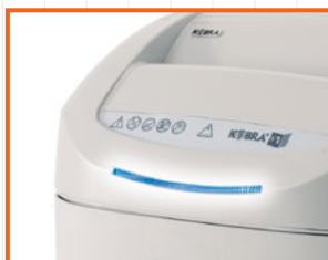
ENERGY SMART power saving system with illuminated optical indicator for power saving stand-by mode