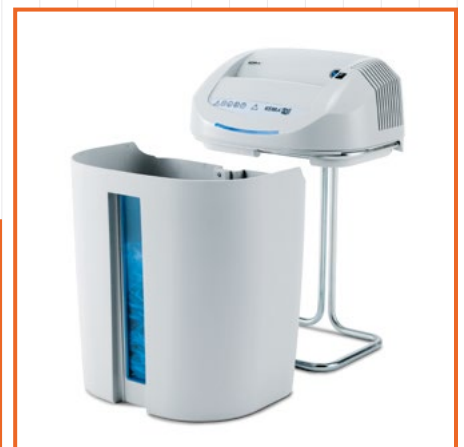
ENVIRONMENTALLY FRIENDLY Removable waste bin for easy emptying operations. Transparent window on the front makes it simple to check the shreds level. No need of plastic bags.